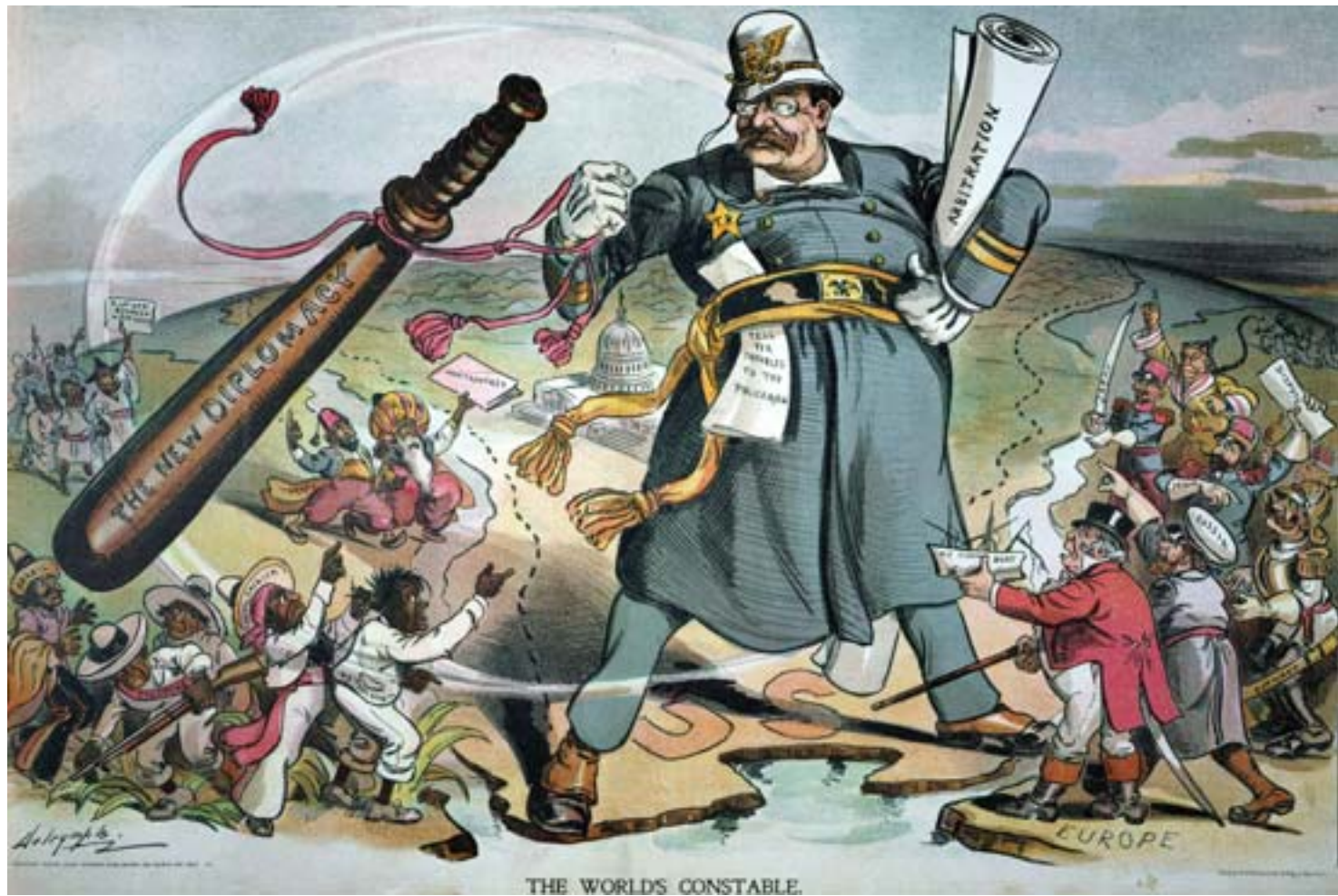
“THE WORLD'S CONSTABLE”